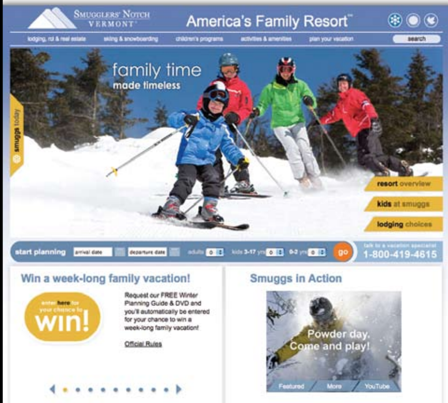
Website Refresh - http://www.smuggs.com/

Smugglers' has been positioning itself as America's Family Resort for nearly 50 years, and even has a service mark for the term. However—conceptually—it's a very difficult thing to portray in an advertisement or direct-response piece that has less than three seconds to engage the reader. We needed to find the iconic message that represented how encompassing the vacation experience is at Smugglers'. What could say to a family "We have everything you need here for the ideal vacation experience" in three seconds or less?